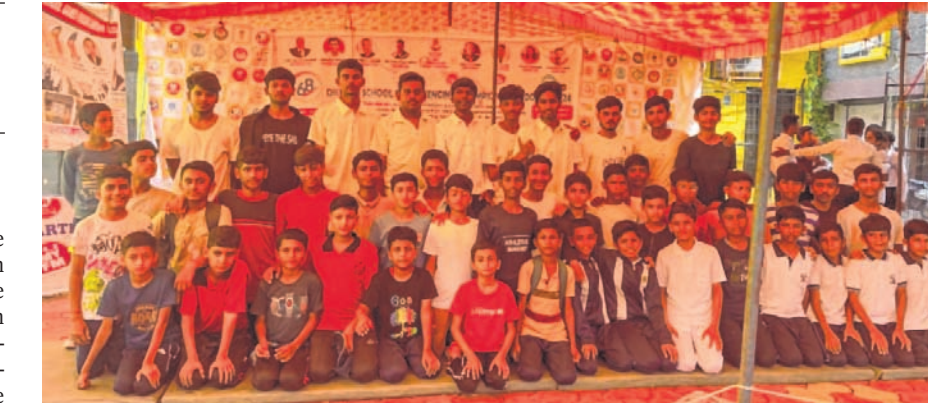
Medal winners from the 68th District-Level Fencing Competition come together for a memorable prize distribution ceremony

Lavkush Vidya Niketan and Saraswati Vidya Vihar stood third and four with 10